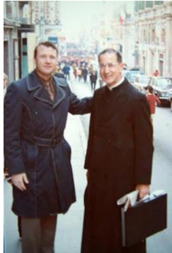
A humble Pastor asking for prayer!