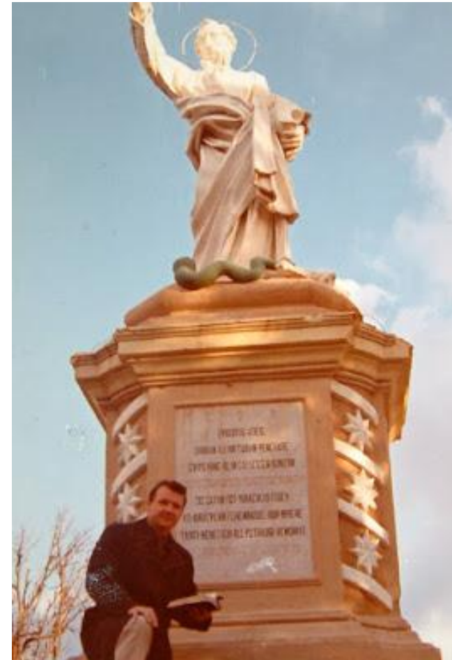
St. Paul's statue in prominent places