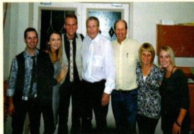
Amundrud Family Team